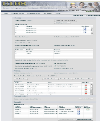
The CIGS application

"Zend tools enabled us to manage everything"